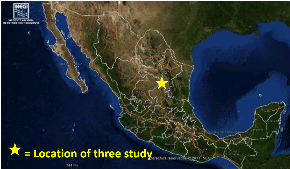
Figure 1. Study locations, Mexico. Map generated courtesy of INEGI data ( www.inegi.org.mx ).