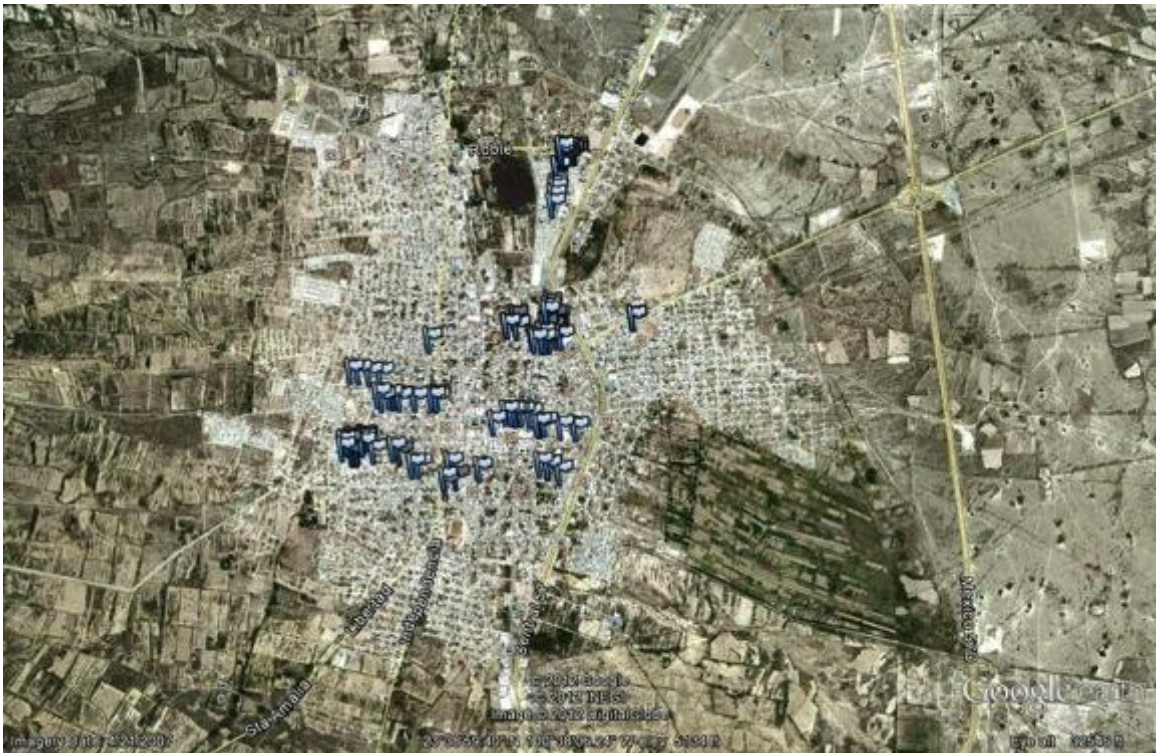
Figure 9. Distribution of surveyed sampling points in Matehuala. Information courtesy of INEGI ( www.inegi.org.mx ) and Google Earth ( www.googleearth.com ).

The majority of small rural communities of Matehuala also have access to piped water, though whether or not this water comes directly into their homes or they collect their household water from watering stations varies by community. Typically, there is a big measurer or macro medidor next to a valve at a point in the pipe that can be shut on or off by SAPSAM, depending on whether or not the community has paid their last water bill. This macro medidor keeps track of the total liters consumed by the community in a month, and it is up to the community members to self-report this quantity to SAPSAM officials, and to pay (collectively) what they owe. SAPSAM does not authorize its water to be used for agricultural purposes, though this can be difficult to enforce.