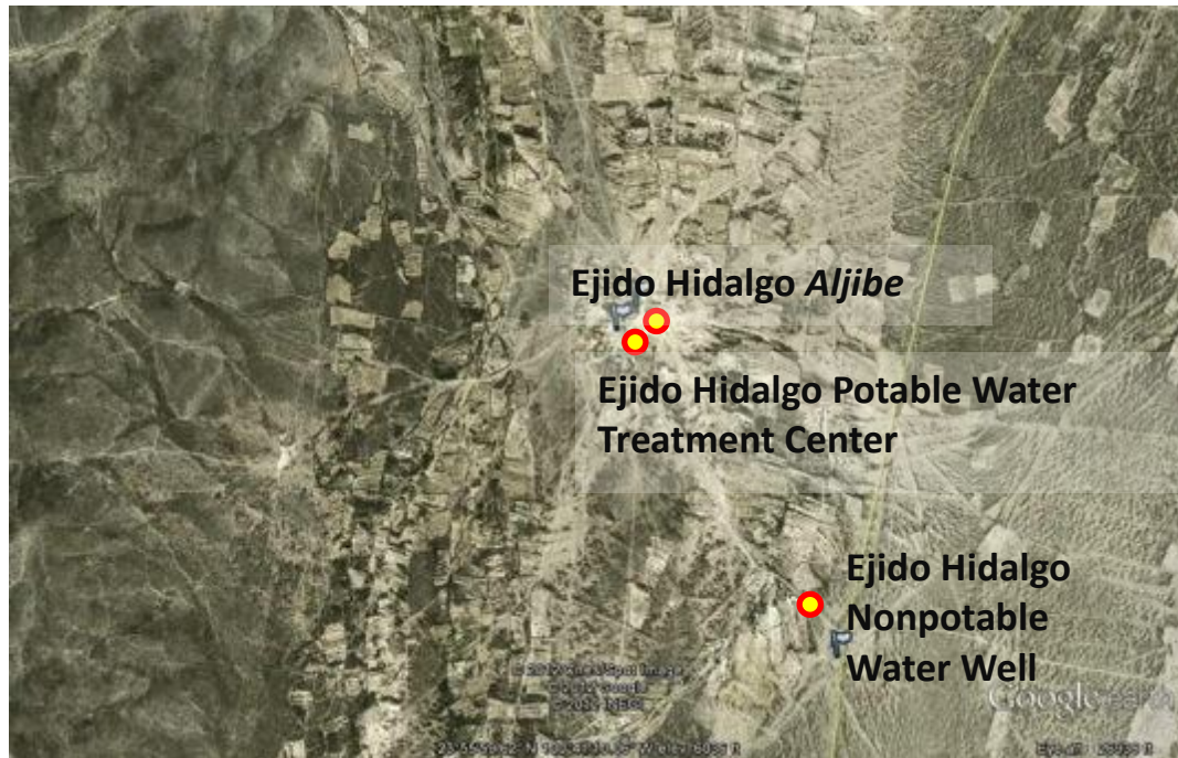
Figure 8. Locations of the pump supplying nonpotable piped water, the water treatment center, and the aljibe in Ejido Hidalgo. Information courtesy of INEGI ( www.inegi.org.mx ) and Google Earth ( www.googleearth.com ).