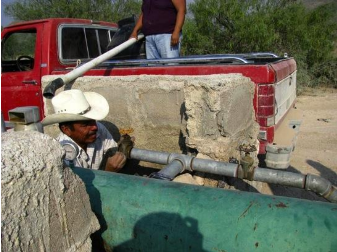
Figure 3. A resident of El Gallo collects water for use in his house from a pump located several kilometers from his residence.

Figure 3 is a photograph taken in El Gallo of a family collecting water from the irrigation pump located outside of El Gallo. Typically, families will bring as many containers as can be carried to the well, and fill each of them using a series of tubes connected to the pump and flowing into the containers. Fill times for each container depend on the size of the container and whether or not the pump is functioning properly.